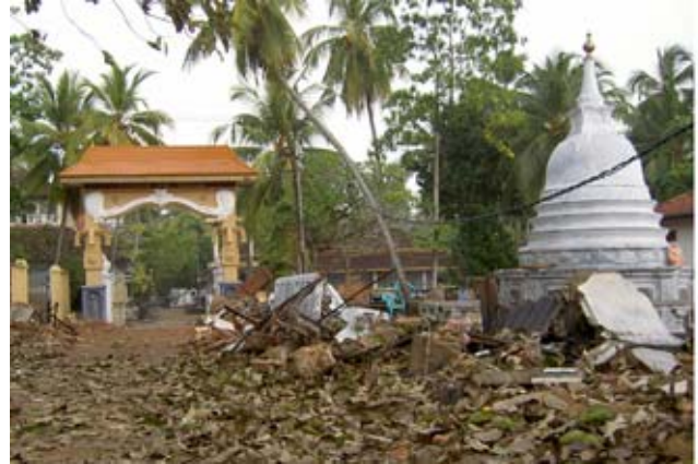
A Buddhist Temple in Galle, Sri Lanka stands in the midst of the tsunami rubble