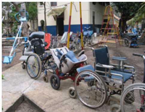
These salvaged wheel chairs were being cleaned. But most of them had to be discarded