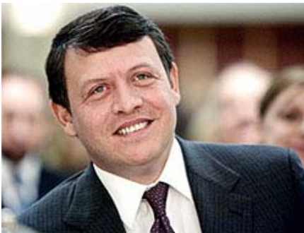
King Abdullah II of Jordan at the luncheon following the National Prayer Breakfast in February

Interfaith relations is quickly becoming mainstream. The National Prayer Breakfast this February, a traditionally evangelical Christian event, was an interfaith event. Sen. Norm Coleman, Minnesota Republican, was the first Jewish co-chairman, and Jordan's King Abdullah, a Muslim, attended the breakfast and gave a major luncheon speech later.